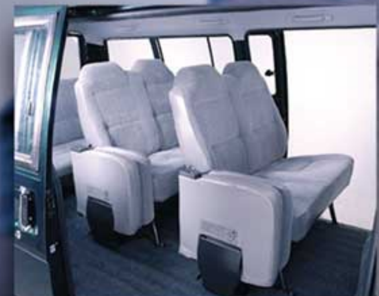
Dual Sliding Doors with Large Openings

The most dependable van in the market just keeps on getting better. Now, the versatile van is offered to business-minded people who look for more practicality and durability. An efficient Mitsubishi Air Conditioning system effectively cools the cabin on hot summer days. The power steering makes a large van like the L-300 as maneuverable as a small sedan. Dual sliding doors with large openings make ingress and egress easier. Its powerplant, the 2.5 liter 4D56 Diesel engine, its drivetrain, and suspension design are proven and well matched to Philippine road conditions. And with Mitsubishi's extensive dealer network and parts availability, the L-300 Versa Van simply edges out the competition.