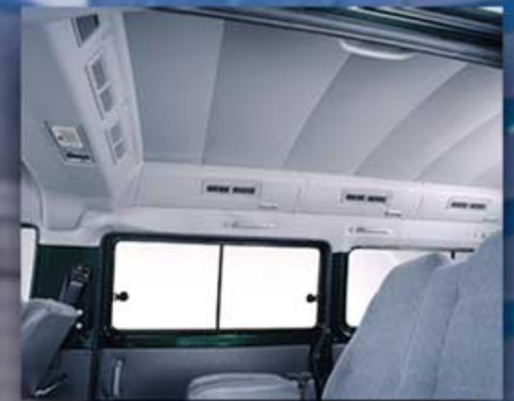
Efficient Dual Air-Con System