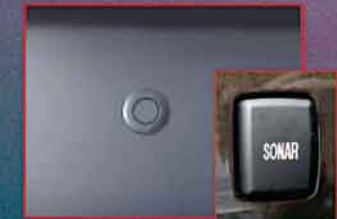
Front and Rear Parking Sensors