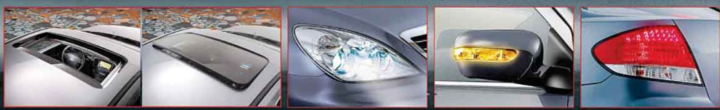
Anti-Trapping Power Sunroof