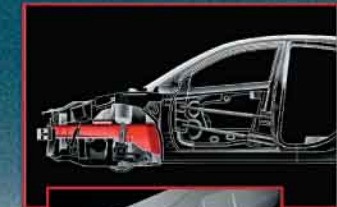
Collision Energy Absorber Joints with Thick and Strong Frame Structure