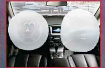
Dual Stage SRS Airbags