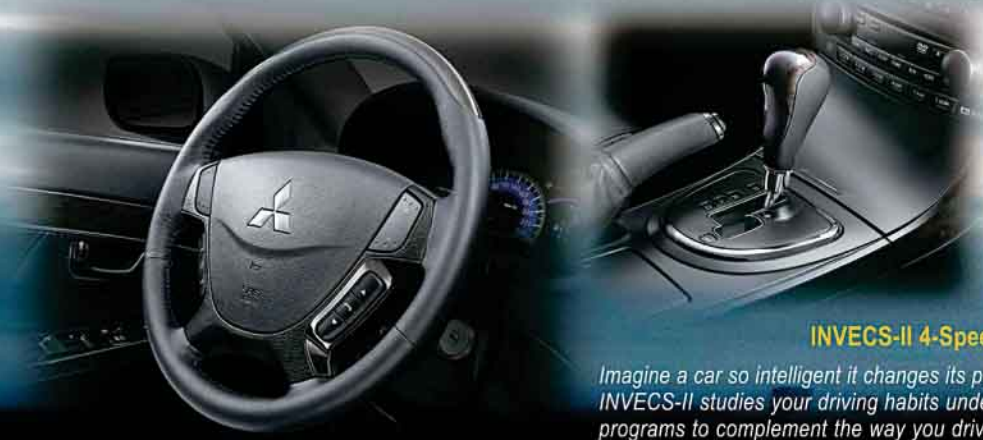
Tiptronic Shifter For Manual-Shifting Automatic